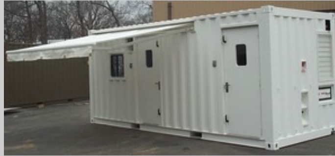
Specially converted ISO Containers.

Personnel Shelters: Custom configured into command and control shelters (Electric and HVAC units installed).