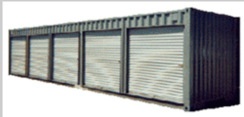
Roll up door and partitions installed to make smaller components